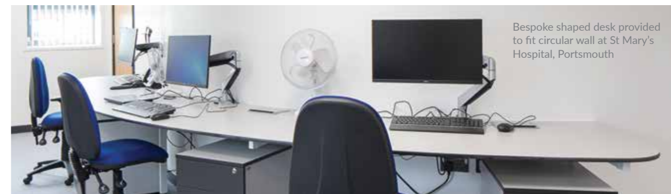
Bespoke shaped desk provided to fit circular wall at St Mary's Hospital, Portsmouth