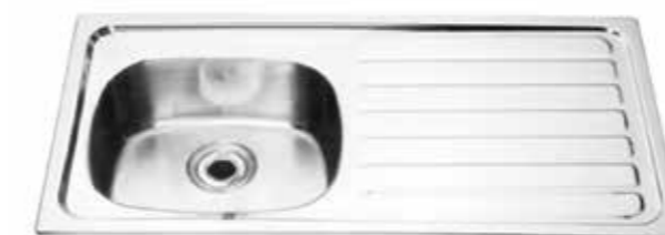
Inset with drainer

This is the most popular bowl type and can be used with all worktop materials. Supplied with or without 200mm tap hole centres. Standard waste kit included.