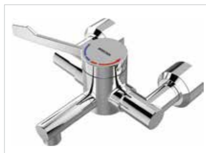
Bristan wall mounted

Bristan TMV3 panel mounted mixer tap with integral thermal flush mechanism. Tap design allows for easy access to parts for servicing.