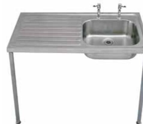
Lay-on sink bowl

Sink bowl with drainer suitable for mounting over a 1000mm wide base cabinet or stainless steel support legs or wall mounted brackets. Bowl supplied with 200mm tap hole centres. Standard waste kit included.