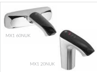
Rada wall & pillar sensor taps

Rada Intelligent care panel mounted or pillar sensor tap. Non-touch flow control, programmable with 12-month data log.