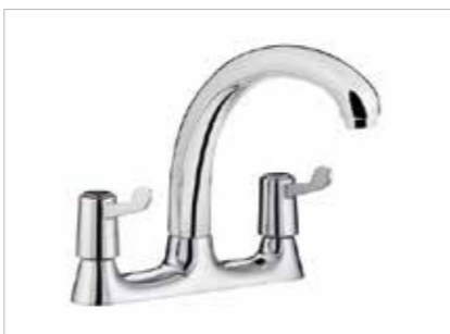
Swan mixer lever tap

Lever operated mixer tap set suitable for beverage and kitchen areas.