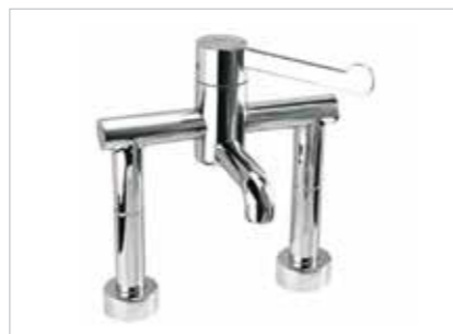
Rada pillar mounted

Rada Safetherm thermostatic pillar mixer tap, TMV3. Chrome plated brass open flow straightener with isolating ball valves. Single sequential lever operation.