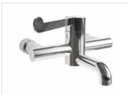
Rada wall mounted

Rada Safetherm thermostatic wall mixer tap, TMV3. Chrome plated brass open flow straightener with isolating ball valves. Single sequential lever operation.