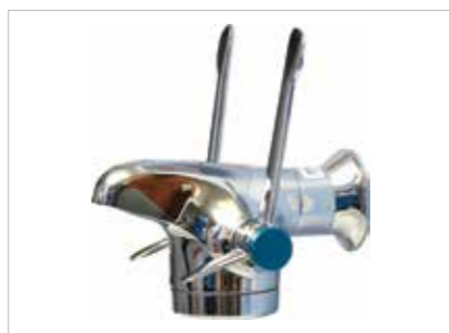
Horne wall mounted

Horne Optitherm tap with 200mm projection. Dual levers for improved infection control. Tap design allows for easy access to parts for servicing.