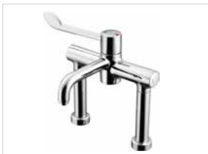
Markwik pillar mounted

Markwik demountable pillar mixer tap (TB H2a) with integral thermostat and single sequential lever operation. With or without detachable spout.