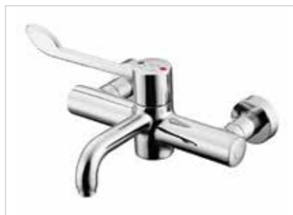
Markwik wall mounted

Markwik demountable wall mixer tap (TB H2a) with integral thermostat and single sequential lever operation. Detachable spout.