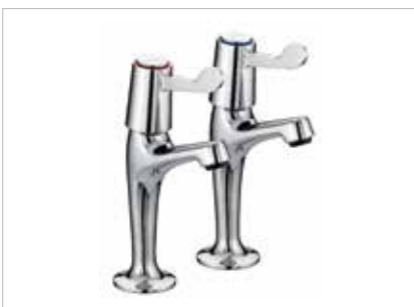
Bristan single lever taps