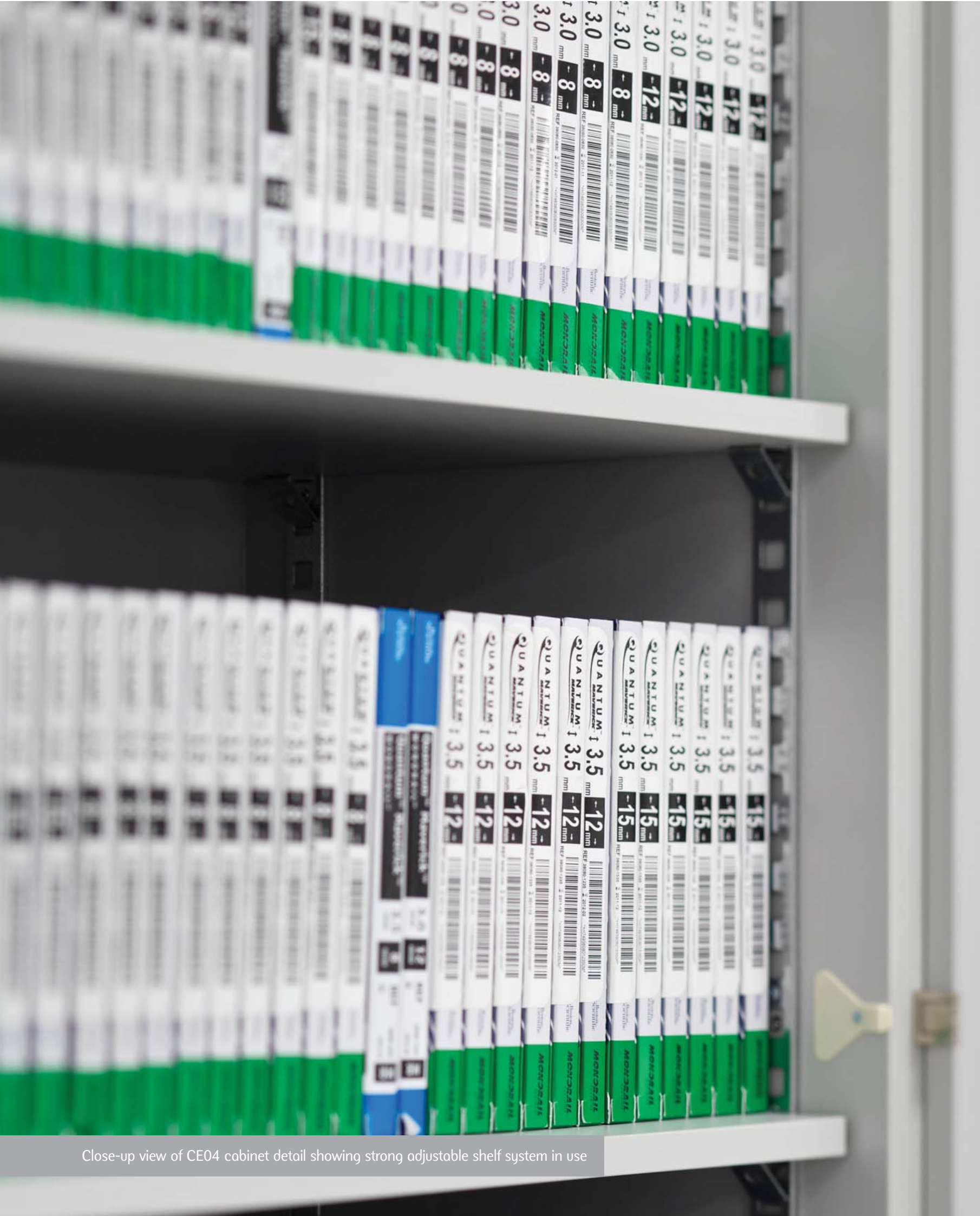
Close-up view of CE04 cabinet detail showing strong adjustable shelf system in use