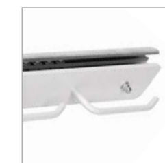
[B] Telescopic In-line