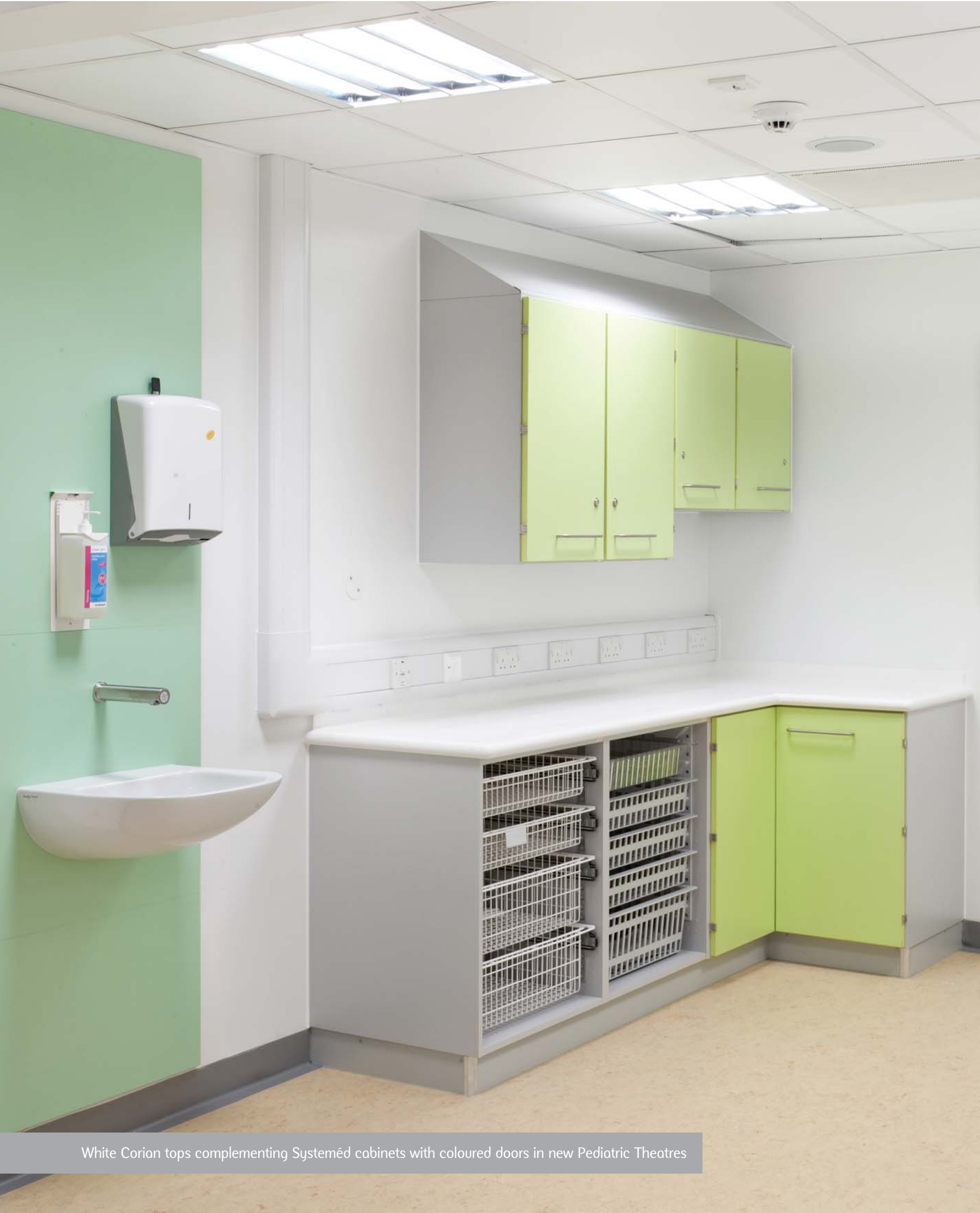
White Corion tops complementing Systeméd cabinets with coloured doors in new Pediatric Theatres