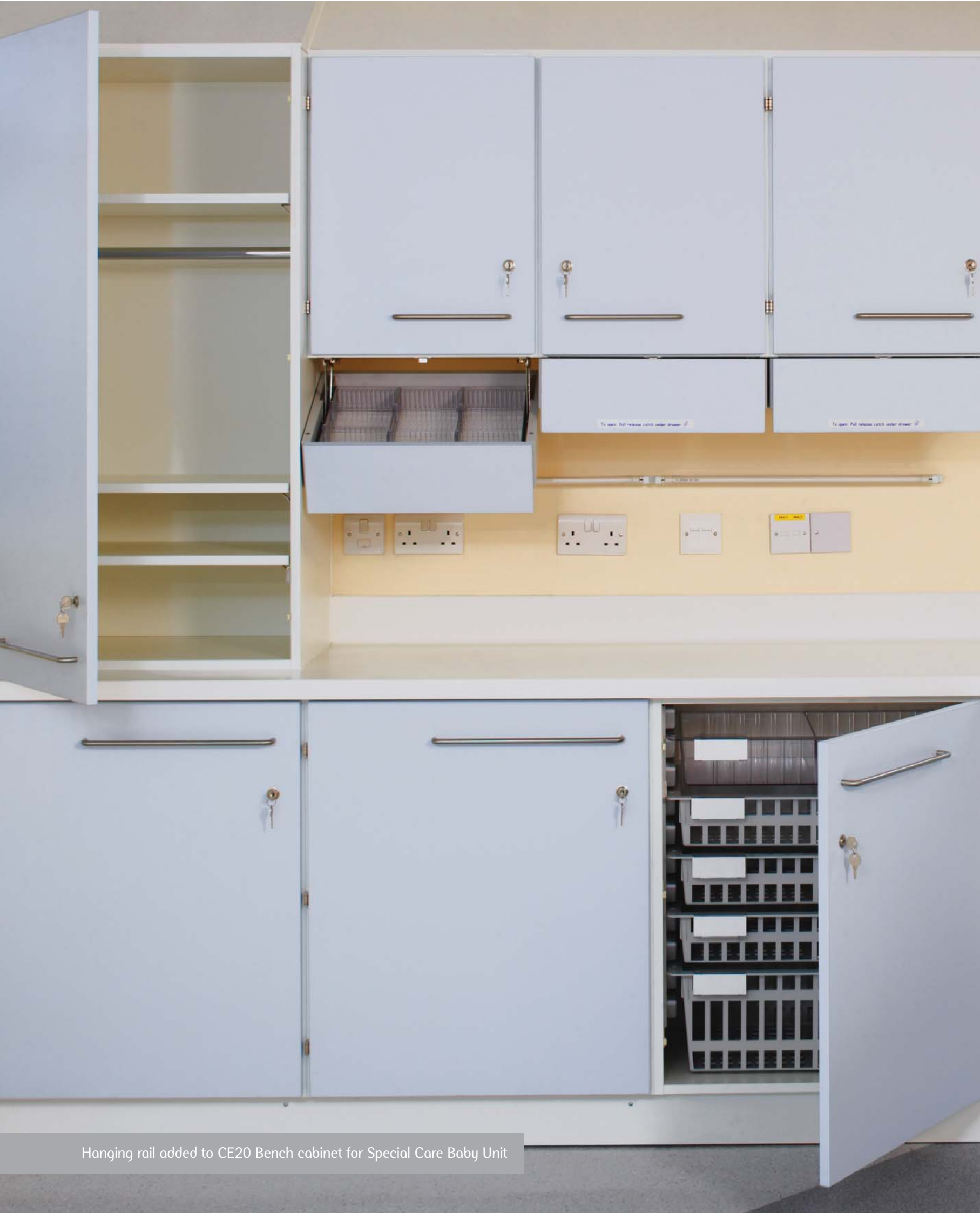
Hanging rail added to CE20 Bench cabinet for Special Care Baby Unit