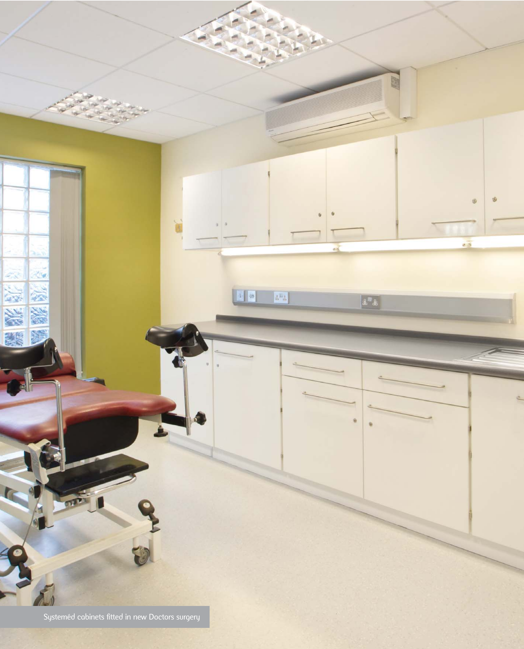
Systeméd cabinets fitted in new Doctors surgery