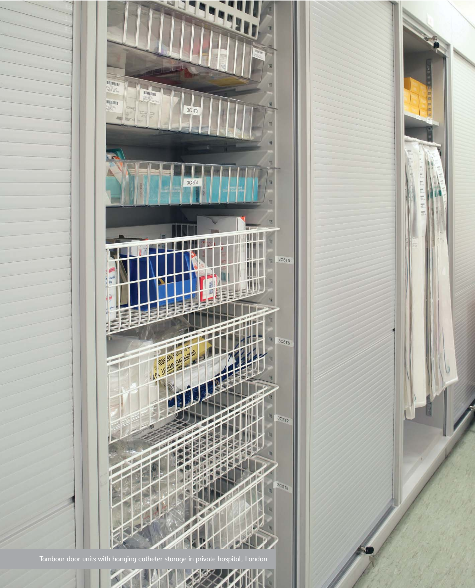
Tambour door units with hanging catheter storage in private hospital, London