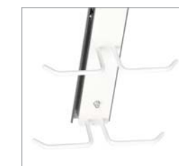
[C] Telescopic Hanging

Organise your Catheters exactly how you want them with our choice of telescopic holders. Types B and C can be used with 1000mm wide cabinets if preferred. Tilt-bin cabinets provide a very good storage solution for boxed catheters (see photo opposite).