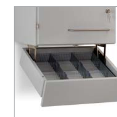
Swing-glide drawer option