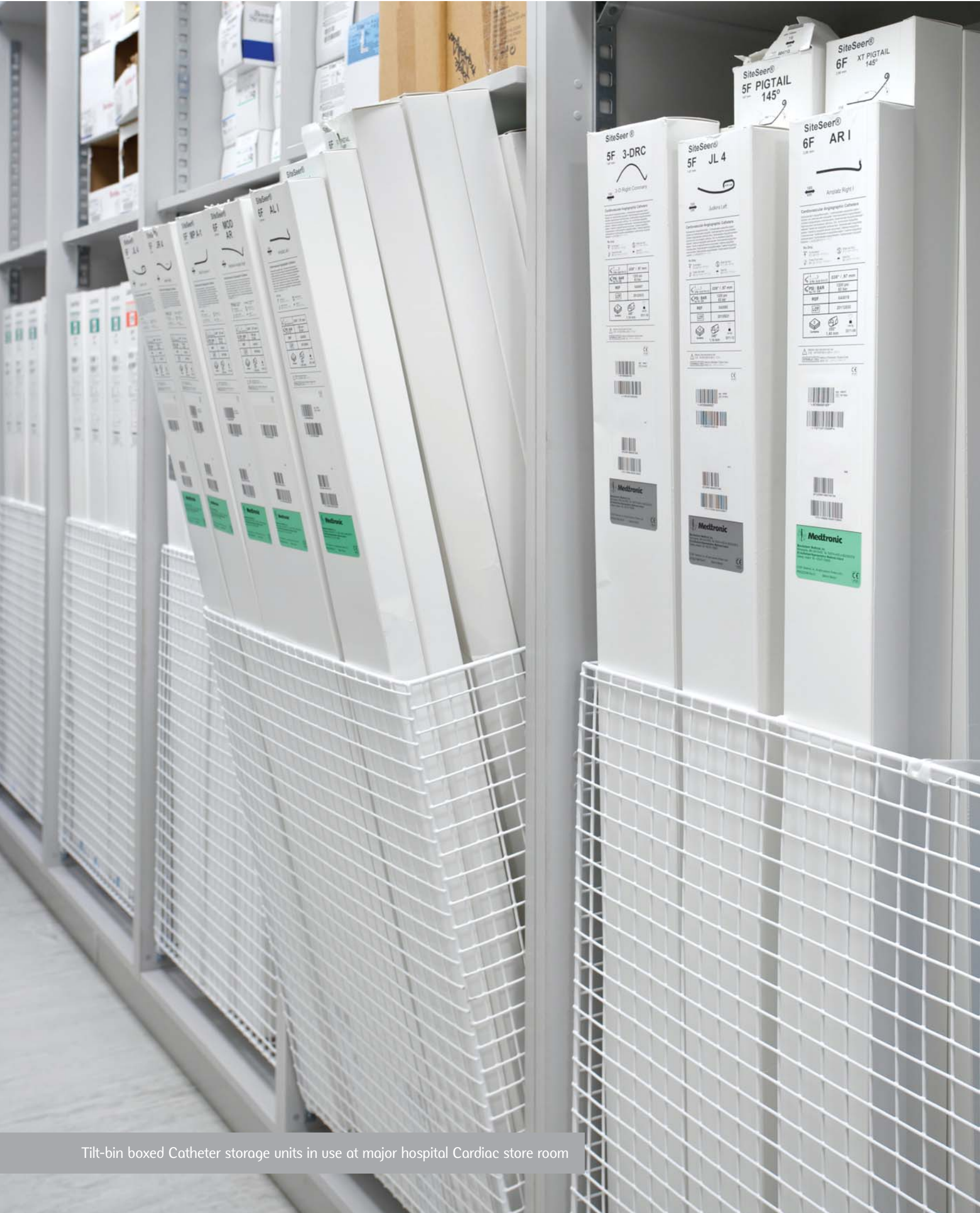
Tilt-bin boxed Catheter storage units in use at major hospital Cardiac store room