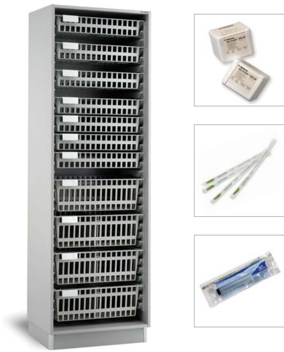
CEO2 Storage of medium/large consumables