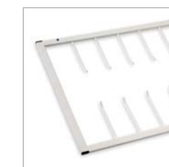
[A] Telescopic Full Frame