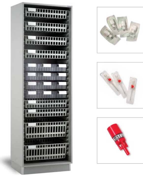
CEO1 Storage of small/medium consumables